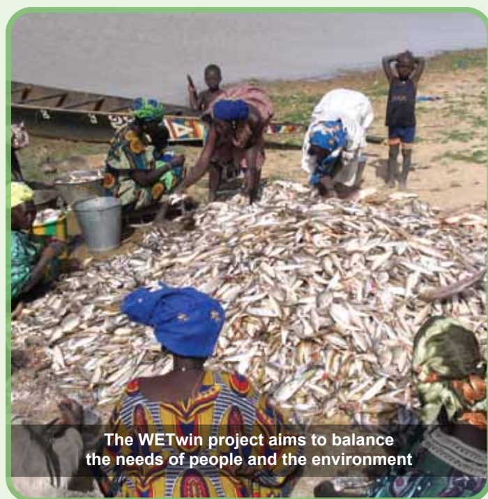
The WETwin project aims to balance the needs of people and the environment

As well as identifying community-based solutions with the aim of utilizing the drinking water supply, sanitation and provisioning potential of wetlands for the benefit of people,