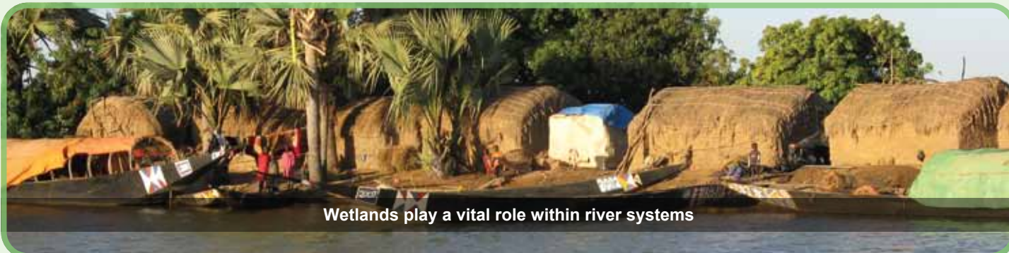
Wetlands play a vital role within river systems

macroinvertebrates, fish) was analyzed. The high ecological importance of the wetland within the river system was demonstrated.