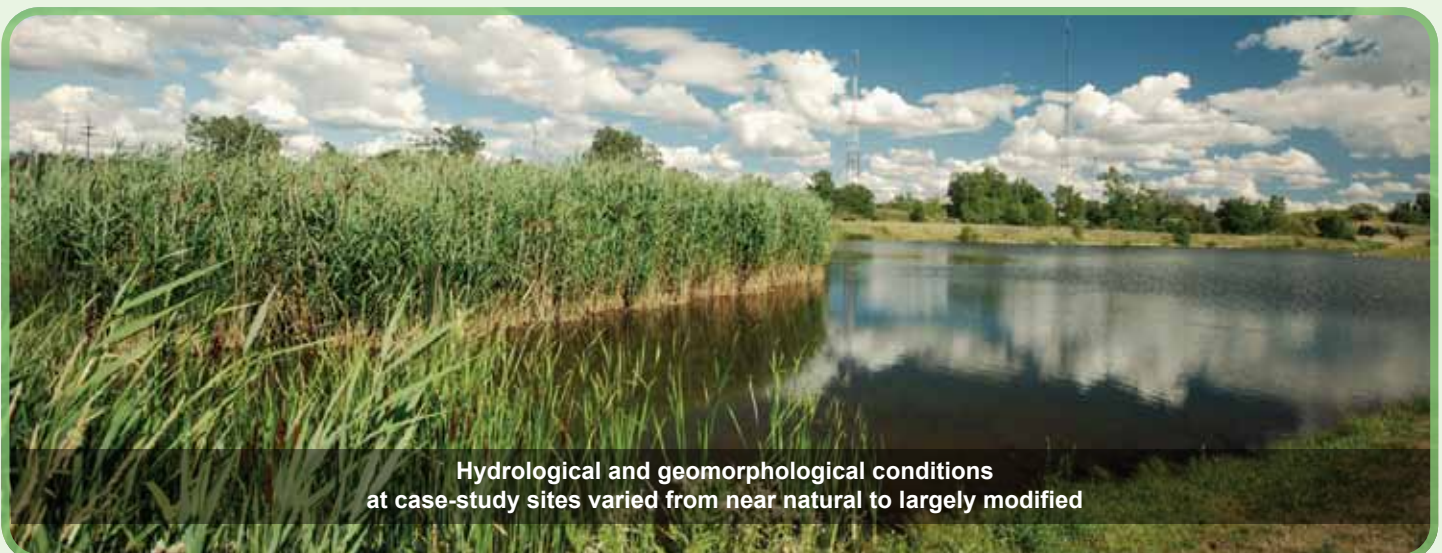
Hydrological and geomorphological conditions at case-study sites varied from near natural to largely modified

anthropogenic activities such as channelization or drainage. The vegetation score reflects the intensity of agricultural activity and the resulting loss of areas with natural wetland